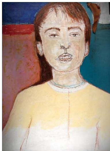
Daughter , mixed media on canvas