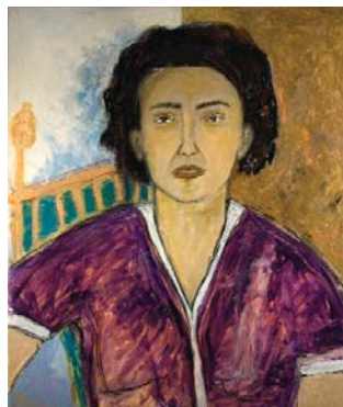
Postmodern Madonna , mixed media on clayboard