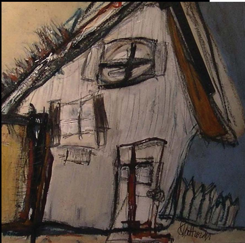
House of stone , mixed media on paper