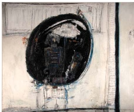
Go Girl , mixed media on paper